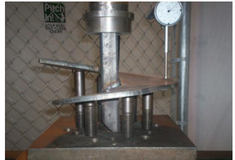
Helix Strength Test