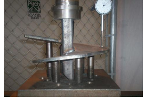
Helix Strength Test